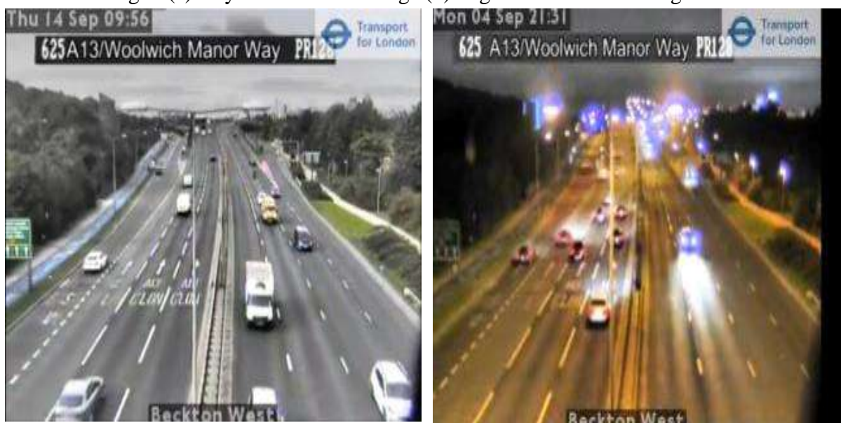
Fig.1. (a) Day time CCTV footage (b) Night time CCTV footage

The data collected can be from any video source such as webcam, CCTV-cam, mobile cam etc. The model can work on live video feed from the traffic junction. For demonstration purposes the video data is collected from: https://s3-eu-west-1.amazonaws.com/jamcams.tfl.gov.uk some video samples are as in Fig.1.