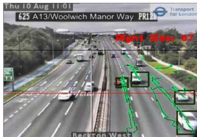
Fig.4. Final output screen counting and tracking each vehicle in Region of Interest (ROI).

After each Fig. 3 (a) Mean thresholding on starting frames (b) Mean thresholding on frames after sometime (c) Merging blobs after removal of noise and hole filling (d) Setting up region of interest complete cycle, the traffic signals will reset themselves and start operating in the similar fashion before.