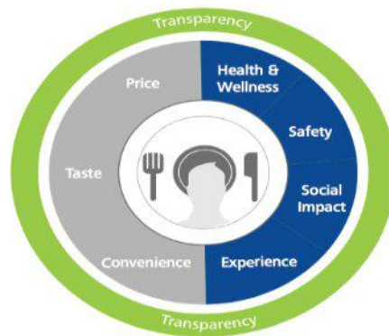
Figure 1.1: Traditional and evolving drivers

the gap between respondents are only 2%, but still it shows that most of the participants are inclined towards evolving drivers. Hwang and Lorenzen (2008) analyzed that restaurant clientele showed the most optimistic attitude toward a low-calorie food and were willing to pay even more when nutrition information was provided. According to Nielsen's Global health and wellness report (2015) included 30,000 participants, around 88% consumers state that they tend to pay more to get 'healthy food' (claim to boost health and weight loss) on their plate that.