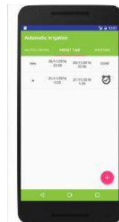
Fig 5. Preset Time Feature

Application provides a feature to add preset timings where user can set date and time and application will automatically turn ON/OFF the water pump at that time. These set timings can be set on and off just like an alarm system.