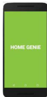
Figure 2 Home Genie Android Application

An android application made using Android Studio IDE. This application connects to internet and send signal to query the database which is saved on cloud. The signal sent is either 0 or 1 to switch OFF and ON the ESP respectively. Application offers features such as maser control that is used to trigger the water pump any time and overrides all other requests. It gives an option to add preset timings for automatically querying the database at set Date and Time saved by user. It will push notifications to notify user at such an event. Application also presents weather forecast with precipitation value for that day and will automatically cancel any preset watering if good amount of rainfall is detected.